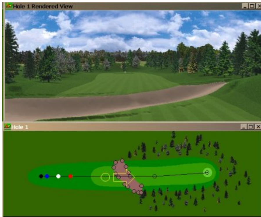
Figure 1. Probably the easiest way to create that "rolling" look is to use the "terrain" shape and draw a long, skinny shape across the fairway. Click on the "bulge down" button once. (You can also click on the "bulge up" button but the elevation will bulge in the middle - not a good thing in the middle of a fairway!)

This tutorial will discuss one option on how to create a rolling fairway with the Jack Nicklaus 5-6 course designer program. Putting some shape in the fairway will add a lot of interest in the golf hole and will make it more like a place to strike a golf ball rather than a place to roll a bowling ball! If you are not familiar with the terms and techniques used here, check out the first tutorial of this series, "Basic Elevations" for an explanation.